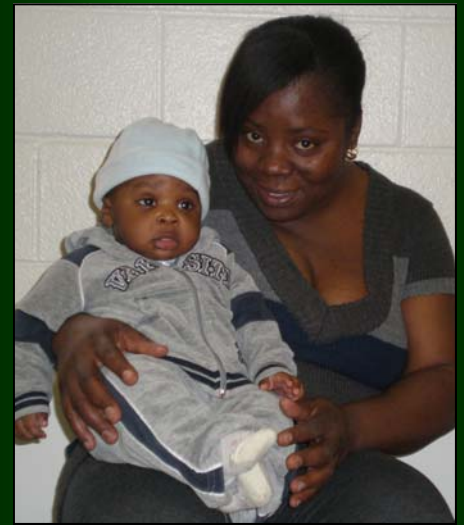
A Mom who attended Role Model Moms